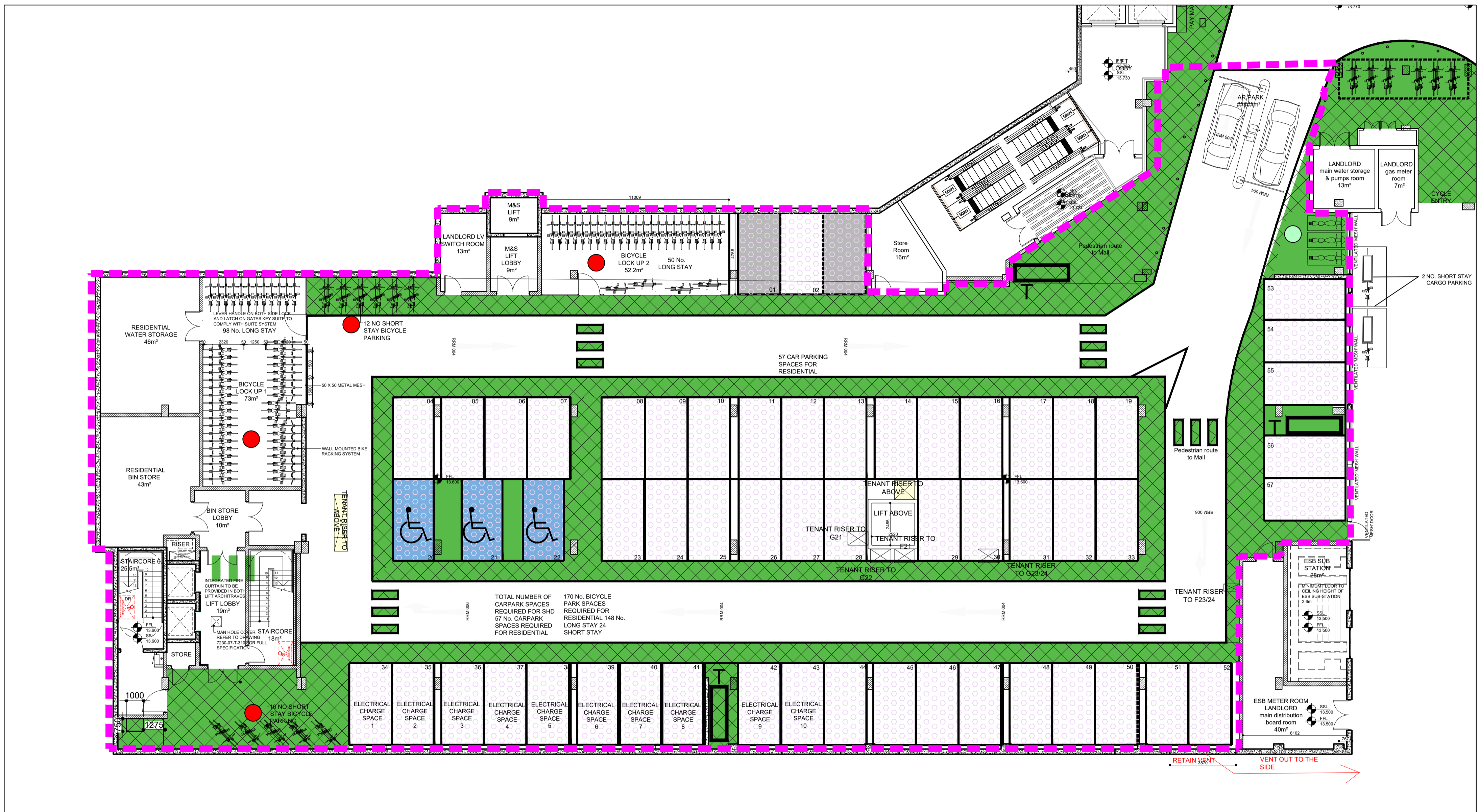
○ PROPOSED LOWER GROUND FLOOR CAR PARKING PLAN ( RESIDENTIAL ) Scale: 1:150 @ A1